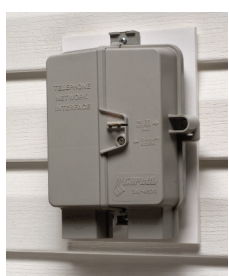
Cable TV boxes...