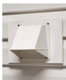
Vents and more