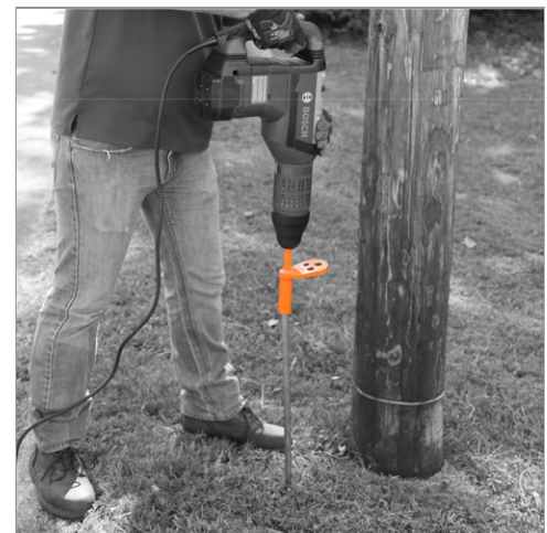
Tool locks into hammer drill