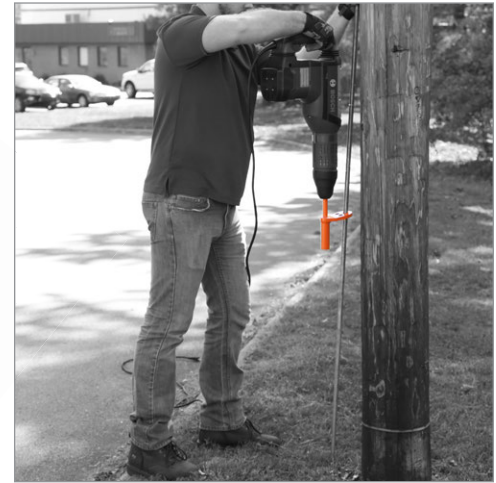
Safely drive rods from ground

Safely drive 1/2", 3/8", 5/8", and 3/4" rods from the ground in under a minute with iTOOLco's Ground Rod Dawg™. Once rod is driven down far enough the tool will hammer from top to finish driving rod under grade levels from ground.