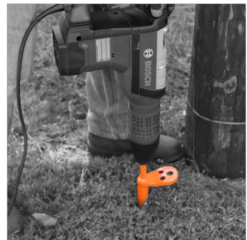
Fits 1/2", 5/8" and 3/4"