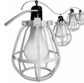
Flat Wire Cable Style

Note: Not for use with Rough Service Lamps