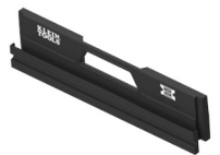
INTERNAL RAIL ACCESSORY (54818MB) (fits inside 54802MB & 54803MB)