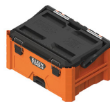
MEDIUM TOOLBOX (54803MB)