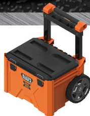
ROLLING TOOLBOX (54802MB)