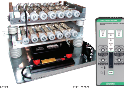
NGR Neutral-Grounding- Resistor System