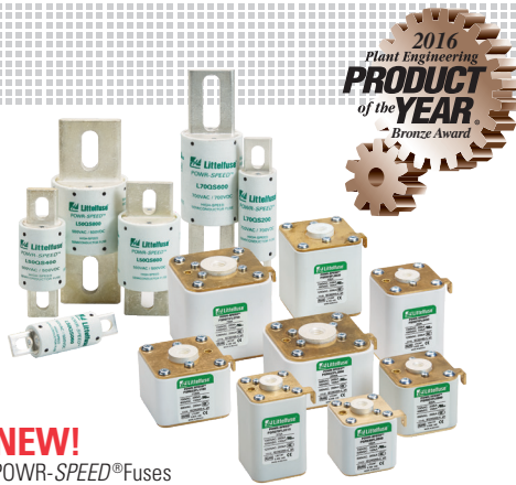
NEW! POWR-SPEED® Fuses