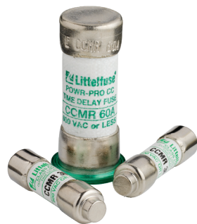
Class CC Fuses