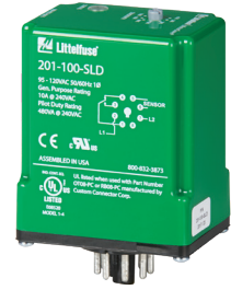
201-100-SLD Seal-leak Detection Relay