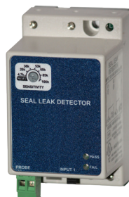
460-15-100-SLD Seal-Leak Detection Relay