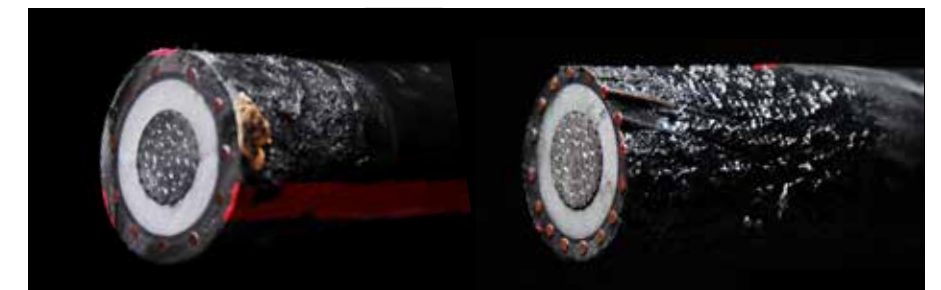
Cable Protected with Scotch® Fire Retardant Electric Arc Proofing Tape 77 after test